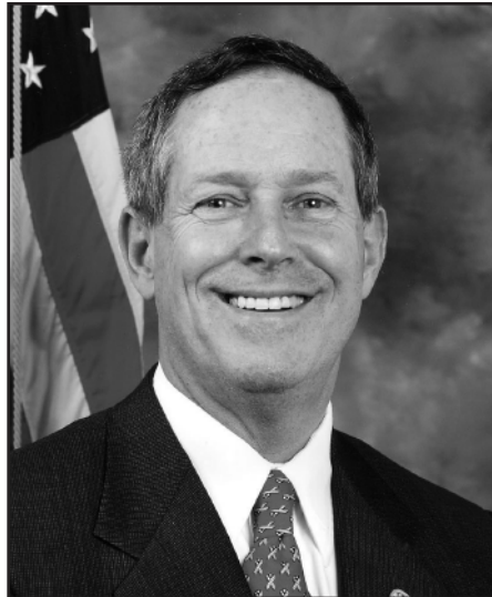
Rep. Joe Wilson (left) and Sen. Jeff Sessions are the lead sponsors of the Freedom from Union Violence Act,

On November 26, after the USWA brass had called a strike, two vans attempted to deliver food, security personnel and a salaried worker into one